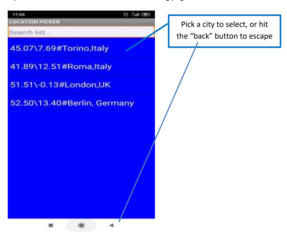
Figure 4 Cities list picker