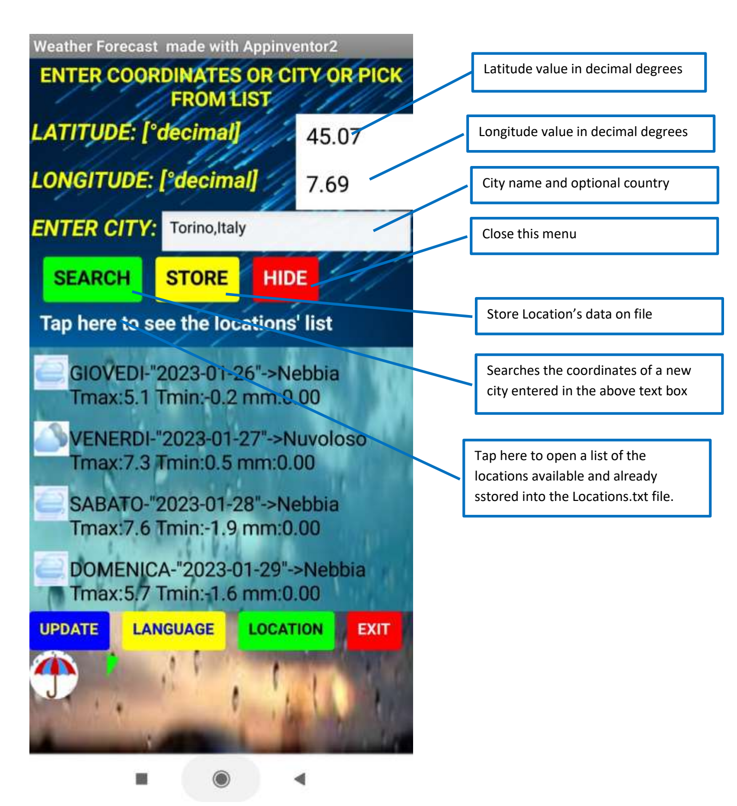
Figure 3 Location Settings Menu

This menu appears when the green LOCATION button has been hit.